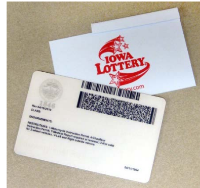
Iowa driver's license and the Iowa Lottery sleeve to aid in scanning.