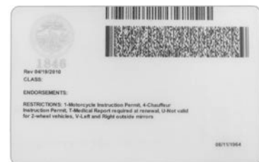
New Iowa driver's license (top) and old Iowa driver's license (bottom).

All of the licenses and I.D. cards have two bar codes on the back. It is the 2D bar code, which is somewhat taller and has a complex pattern, which contains the relevant information