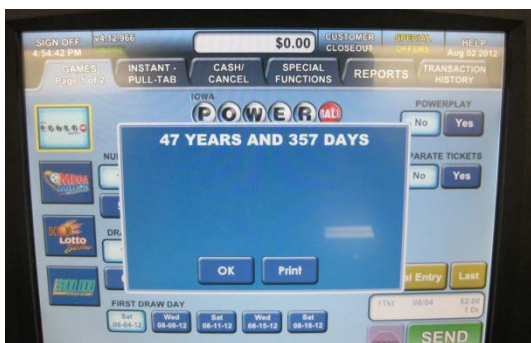
An example of the display after scanning a driver's license on the Wave terminal.

When the lottery terminal has successfully read a driver's license, it displays a simple message stating the exact age of the person whose license has been read, such as: 22 years, 341 days. If a record of the verification is needed, the information on the screen can be printed from the terminal. The message will be printed on the same paper used to produce tickets in lotto games such as Powerball® and Mega Millions®.