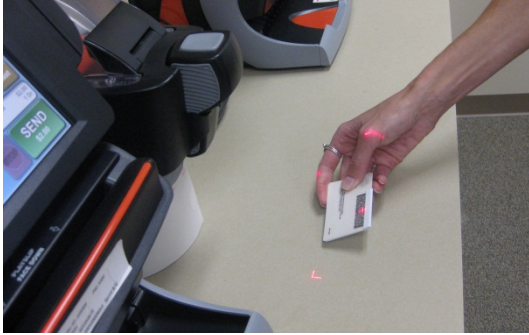
Scanning a driver's license with the Wave terminal.

A two-year project by PMCI, the Iowa Lottery and Iowa Department of Transportation has produced an additional tool that can enhance existing procedures to fight the under-age sale of alcohol, tobacco and lottery tickets.